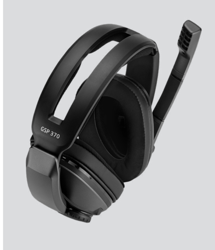
GSP 370 Frequently Asked Questions