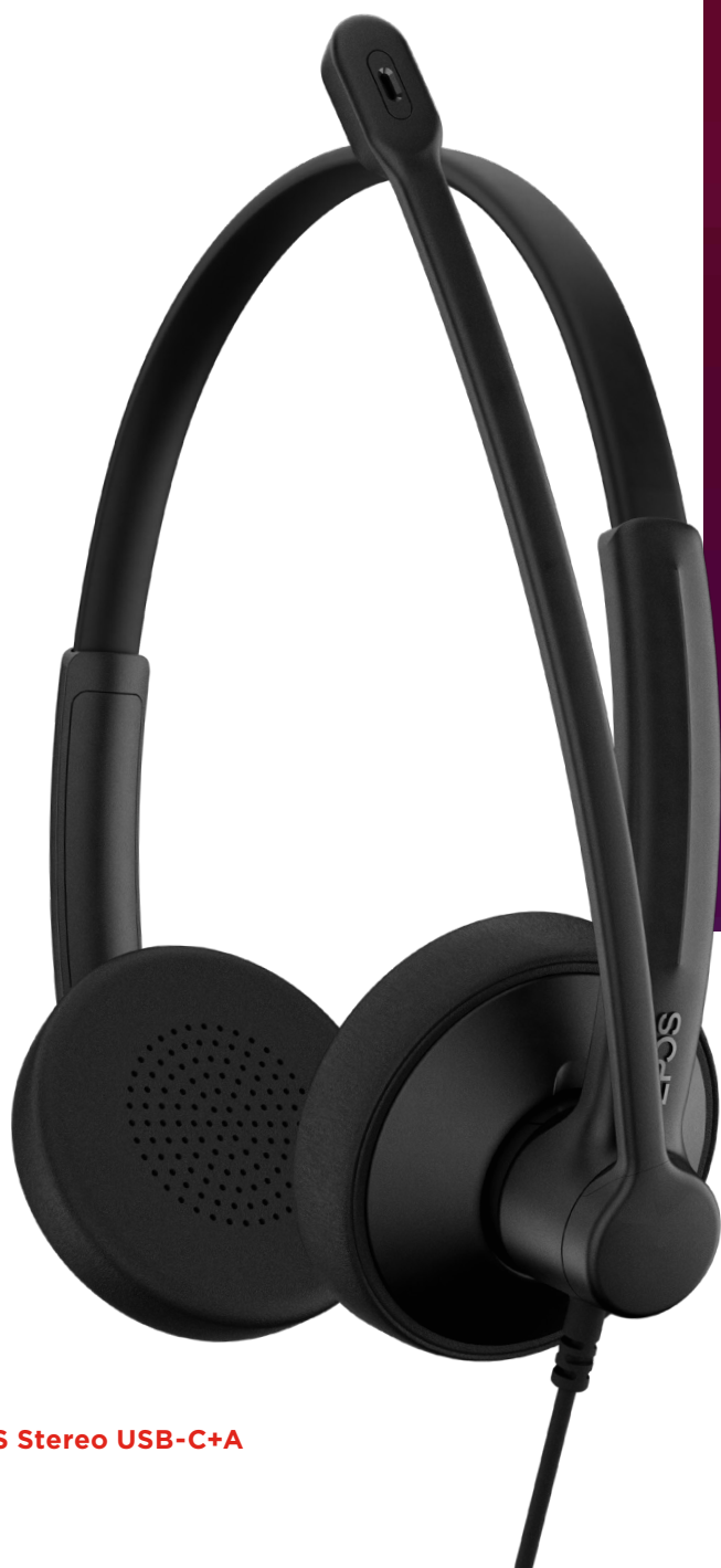
IMPACT 100 MS Stereo USB-C+A

The IMPACT 100 is an entry-level headset that delivers exceptional value for money. With smart features that enhance efficiency and an ultra-lightweight design, it is an ideal headset for talk-heavy professionals.