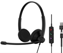
IMPACT 100 MS Stereo USB-C+A