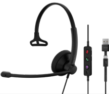
IMPACT 100 MS Mono USB-C+A