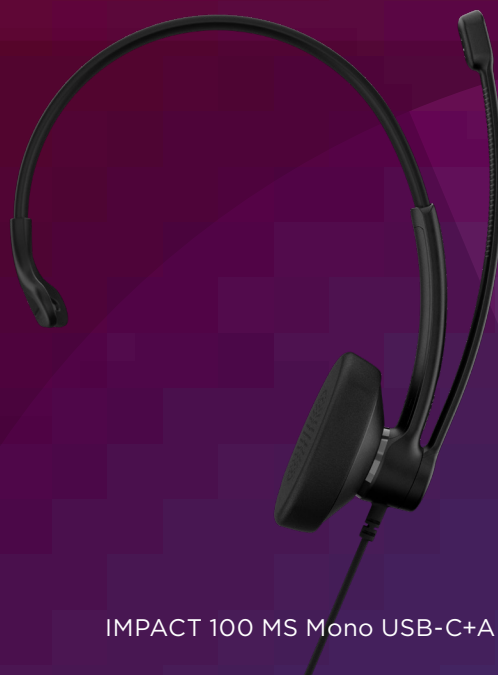
IMPACT 100 MS Mono USB-C+A