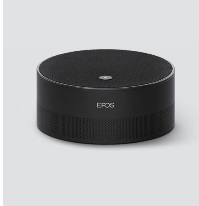
EXPAND Capture 5 Frequently Asked Questions